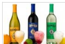
Recipes: Snowball Cocktails