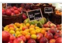
Sassi to Teach Cooking with Summer Fruit