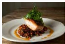
A Taste of Praying Monk