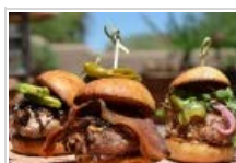
New and Improved Last Drop at the Hermosa